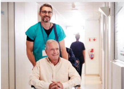
HLT23215 CERTIFICATE II IN HEALTH SERVICES