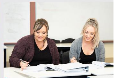
CHC43115 CERTIFICATE IV IN DISABILITY