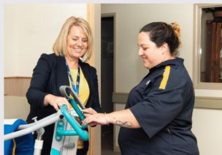
CHC33015 CERTIFICATE III IN INDIVIDUAL SUPPORT (Disability)