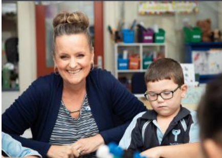
CHC30213 CERTIFICATE III IN EDUCATION SUPPORT

These courses are fully funded for eligible participants with no cost to you.