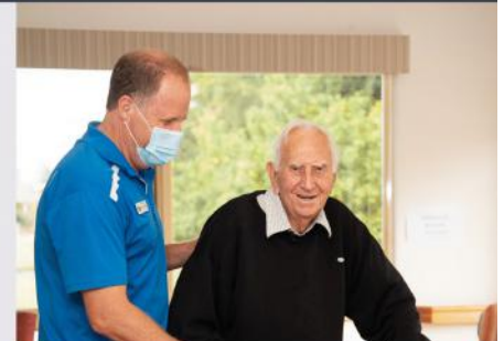
CHC33015 CERTIFICATE III IN INDIVIDUAL SUPPORT (Ageing, Home and Community)

These courses are fully funded for eligible participants with no cost to you.