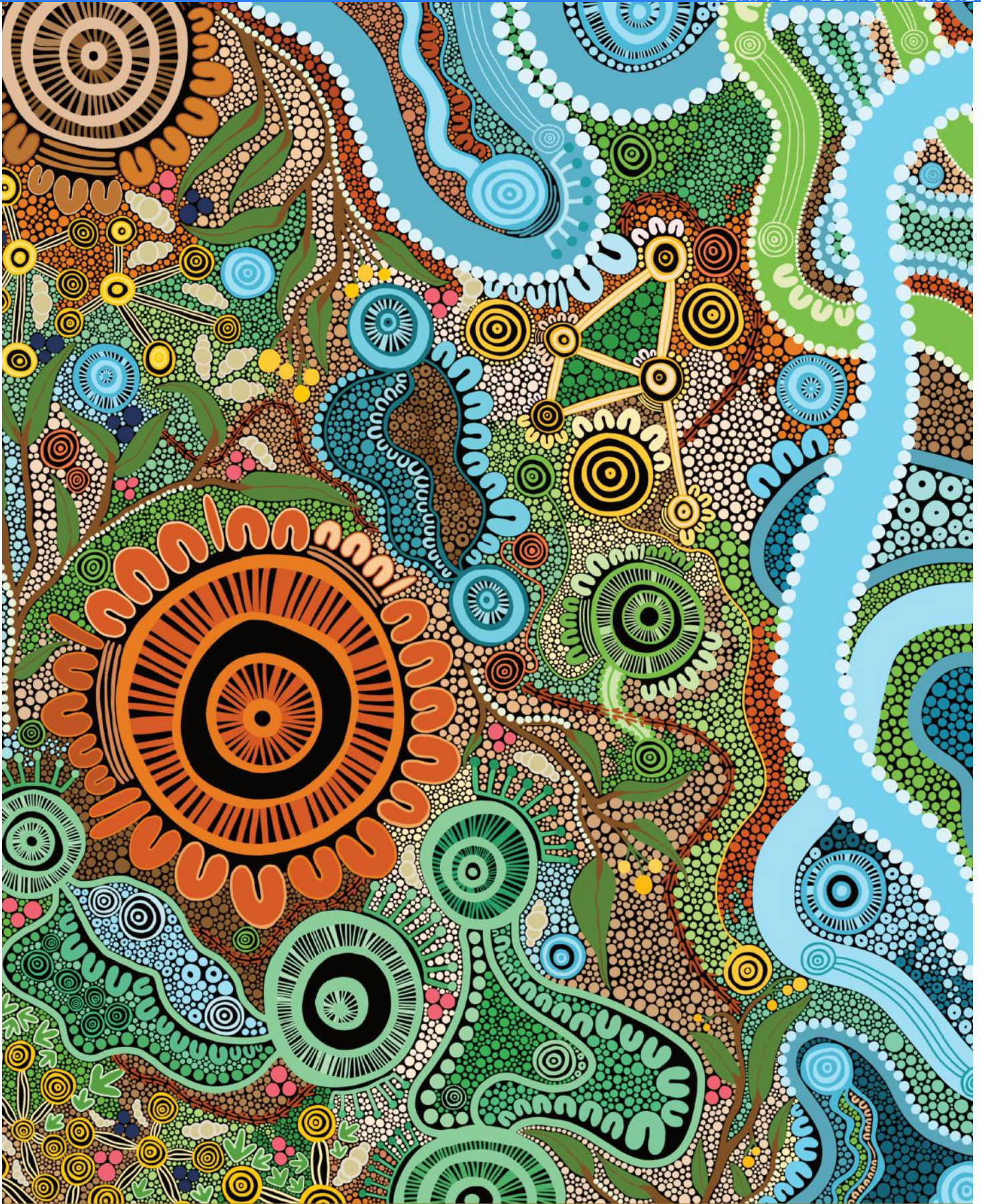
Artwork: Care for Country by Maggie-Jean Douglas (Gubbi Gubbi)

When creating 'Care for Country' I kept in mind that this meant spiritually, physically, emotionally, socially and culturally – I chose to create a bright and vibrant artwork that included the different colours of the land but showed how they come together in our beautiful country and to make people feel hopeful for the future. I've included communities/people, animals and bush medicines spread over different landscapes of red dirt, green grass, bush land and coastal areas to tell the story of the many ways country can and has healed us throughout our lives and journeys.