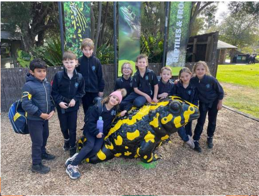
Grade 2 students set off in the dark last Friday for an exciting day at the Melbourne Zoo. Each group participated in a lesson provided by the Zoo Educators and spent the rest of the day looking at the various animals and their specific habitats.

24/7/23 ★ 24 JUL 2023 Checked by Mrs Lidgerwood On the morning on Friday we went on a bus to go to the Melbourne Zoo. First we went to have a quick snack and we got put into groups. Both groups went to the wild sea. First we saw two things fish and sting rays then we saw seals. The next thing that we saw was siamangs and kois rain squirrel monkeys then we saw squirrel monkeys then the great flight aviary. Next we saw elephants. We saw Tasmanian Devils. We saw tigers and snow leopards then we saw Tasmanian Devils. Great reconer Kai! Well done on using full stops.